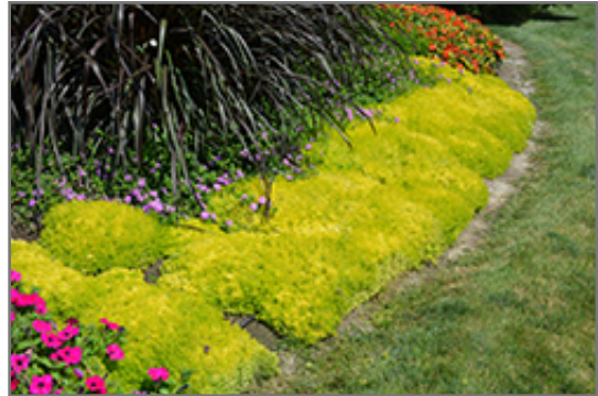
Lemon Coral Stonecrop

This plant does best in full sun to partial shade. It prefers dry to average moisture levels with very well-drained soil, and will often die in standing water. It is considered to be drought-tolerant, and thus makes an ideal choice for a low-water garden or xeriscape application. It is not particular as to soil pH, but grows best in poor soils, and is able to handle environmental salt. It is highly tolerant of urban pollution and will even thrive in inner city environments. This is a selected variety of a species not originally from North America. It can be propagated by division; however, as a cultivated variety, be aware that it may be subject to certain restrictions or prohibitions on propagation.