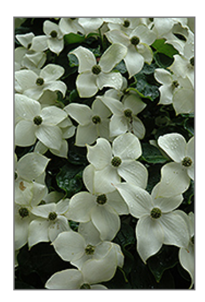
Chinese Dogwood flowers