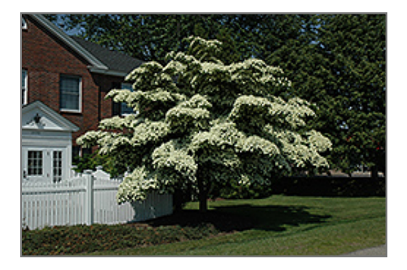
Chinese Dogwood in bloom

This is a relatively low maintenance tree, and should only be pruned after flowering to avoid removing any of the current season's flowers. It is a good choice for attracting birds to your yard. It has no significant negative characteristics.