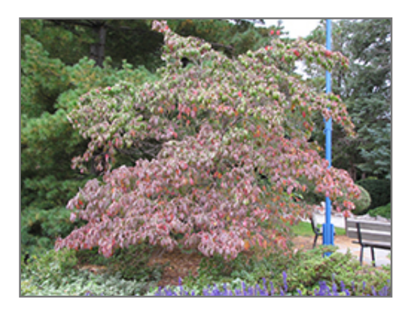
Chinese Dogwood in fall

This tree does best in full sun to partial shade. It does best in average to evenly moist conditions, but will not tolerate standing water. It is very fussy about its soil conditions and must have rich, acidic soils to ensure success, and is subject to chlorosis (yellowing) of the foliage in alkaline soils. It is somewhat tolerant of urban pollution, and will benefit from being planted in a relatively sheltered location. Consider applying a thick mulch around the root zone in winter to protect it in exposed locations or colder microclimates. This species is not originally from North America.