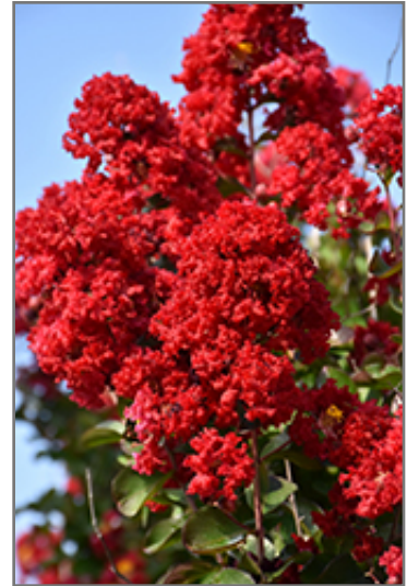
Dynamite Crapemyrtle flowers