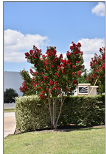
Dynamite Crapemyrtle in bloom