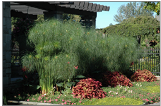
King Tut Egyptian Papyrus