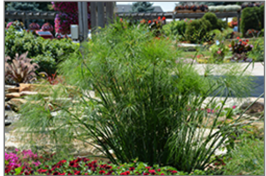
King Tut Egyptian Papyrus