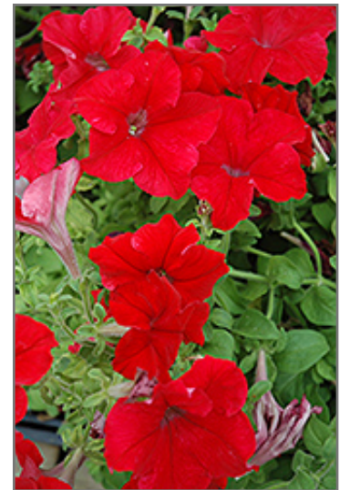
Dreams Red Petunia flowers