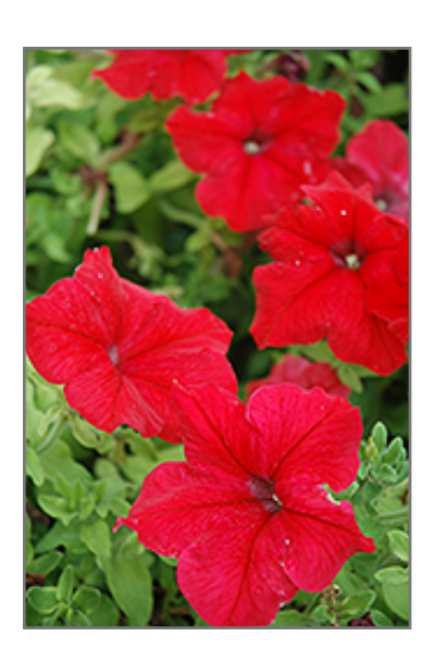
Super Cascade Red Petunia flowers

Super Cascade Red Petunia will grow to be about 15 inches tall at maturity, with a spread of 14 inches. When grown in masses or used as a bedding plant, individual plants should be spaced approximately 12 inches apart. Its foliage tends to remain dense right to the ground, not requiring facer plants in front. This fast-growing annual will normally live for one full growing season, needing replacement the following year.