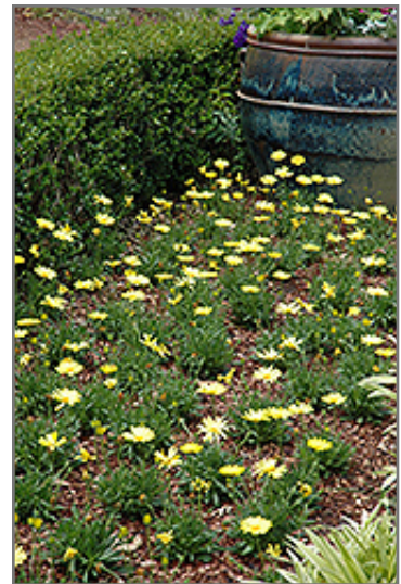
Voltage Yellow African Daisy flowers