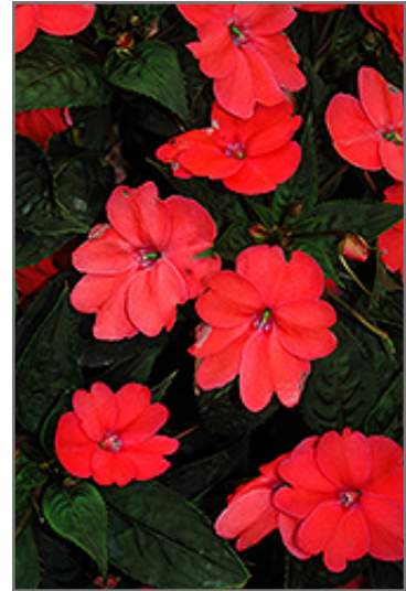
SunPatiens Compact Coral New Guinea Impatiens flowers

SunPatiens Compact Coral New Guinea Impatiens is recommended for the following landscape applications;