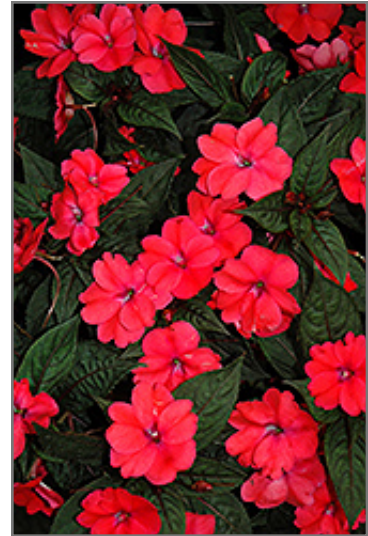
SunPatiens Compact Deep Rose New Guinea Impatiens flowers

This plant will require occasional maintenance and upkeep, and should not require much pruning, except when necessary, such as to remove dieback. It is a good choice for attracting bees and butterflies to your yard. It has no significant negative characteristics.