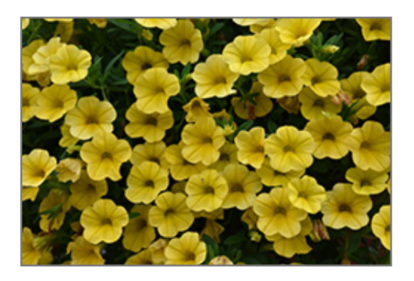
Superbells Yellow Calibrachoa flowers