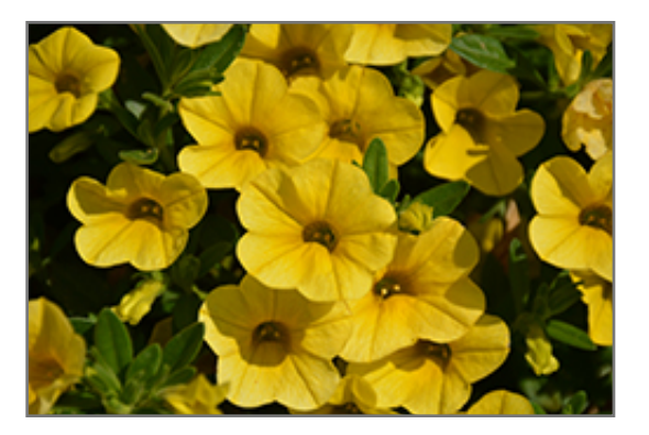
Superbells Yellow Calibrachoa flowers

Superbells Yellow Calibrachoa is recommended for the following landscape applications;