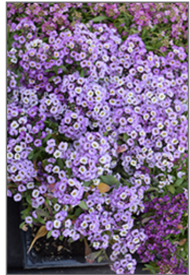
Clear Crystal Lavender Shades Sweet Alyssum flowers

Clear Crystal Lavender Shades Sweet Alyssum is recommended for the following landscape applications;