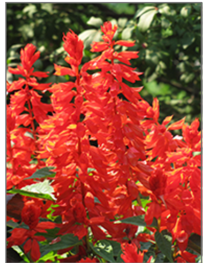
Lighthouse Red Sage flowers