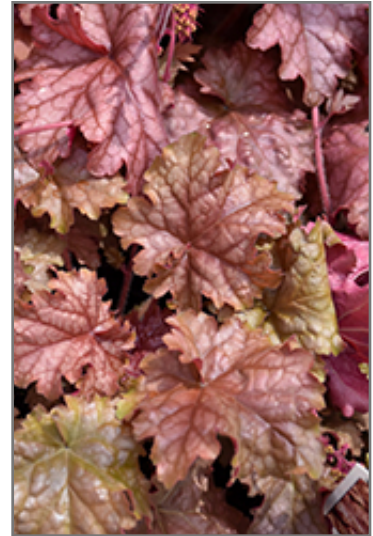
Carnival Peach Parfait Coral Bells foliage

Carnival Peach Parfait Coral Bells is recommended for the following landscape applications;