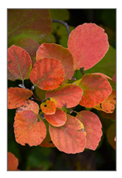
Dwarf Fothergilla in fall