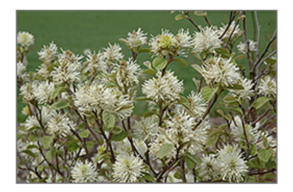
Dwarf Fothergilla flowers

This shrub does best in full sun to partial shade. It requires an evenly moist well-drained soil for optimal growth, but will die in standing water. It is not particular as to soil type, but has a definite preference for acidic soils, and is subject to chlorosis (yellowing) of the foliage in alkaline soils. It is somewhat tolerant of urban pollution. This species is native to parts of North America.