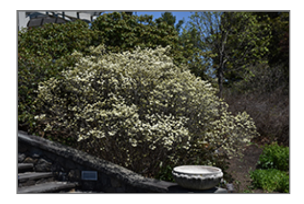
Dwarf Fothergilla in bloom

Dwarf Fothergilla is recommended for the following landscape applications;