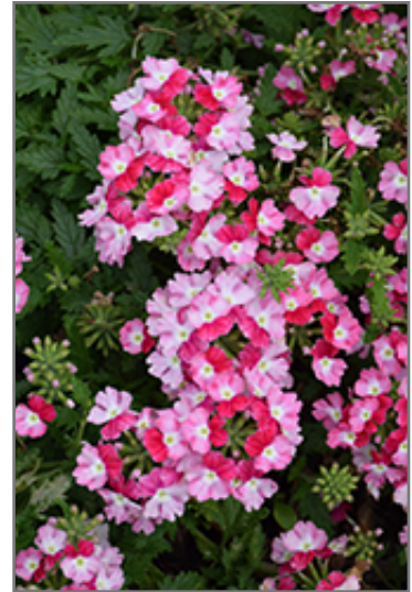
Lanai Twister Red Verbena flowers

Lanai Twister Red Verbena is recommended for the following landscape applications;