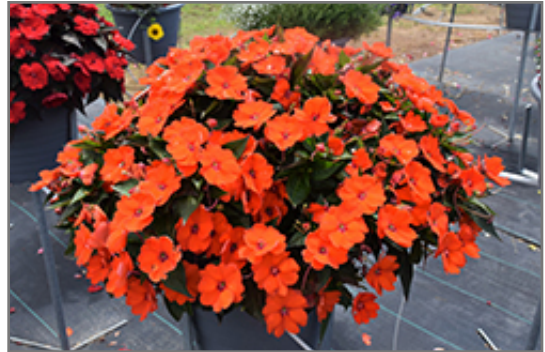
SunPatiens Compact Electric Orange New Guinea Impatiens in bloom

SunPatiens Compact Electric Orange New Guinea Impatiens will grow to be about 24 inches tall at maturity, with a spread of 24 inches. When grown in masses or used as a bedding plant, individual plants should be spaced approximately 20 inches apart. Its foliage tends to remain dense right to the ground, not requiring facer plants in front. This fast-growing annual will normally live for one full growing season, needing replacement the following year.