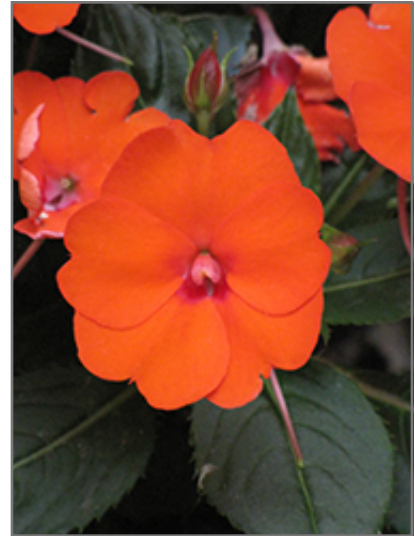
SunPatiens Compact Electric Orange New Guinea Impatiens flowers

This plant will require occasional maintenance and upkeep, and should not require much pruning, except when necessary, such as to remove dieback. It is a good choice for attracting bees and butterflies to your yard. It has no significant negative characteristics.