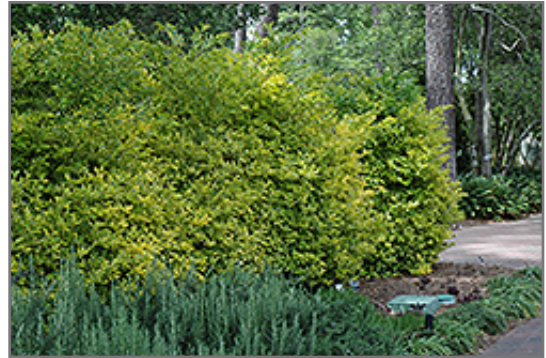
Gold Edge Duranta

Gold Edge Duranta is recommended for the following landscape applications;