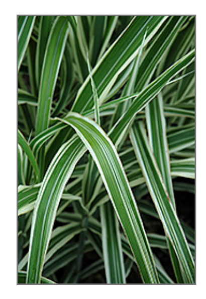
Cosmopolitan Maiden Grass foliage