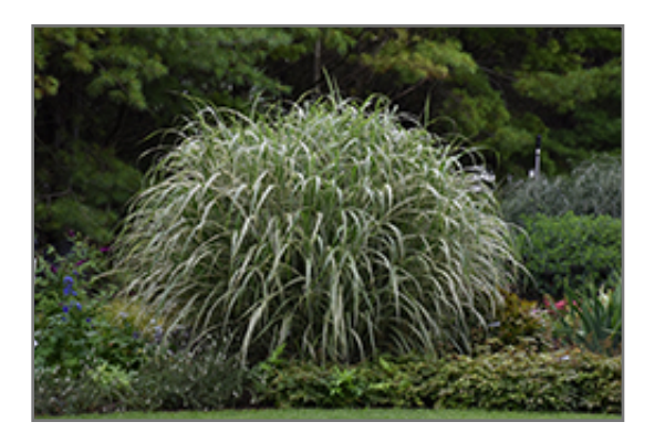
Cosmopolitan Maiden Grass

Cosmopolitan Maiden Grass is recommended for the following landscape applications;