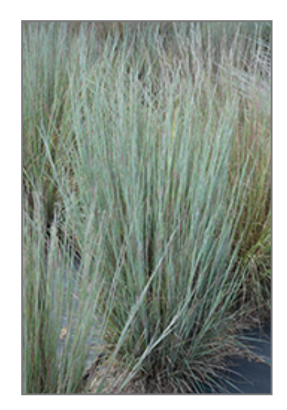
Prairie Blues Bluestem