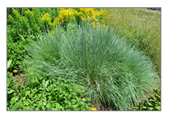
Prairie Blues Bluestem