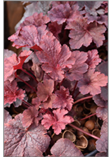
Cajun Fire Coral Bells foliage

Cajun Fire Coral Bells is recommended for the following landscape applications;