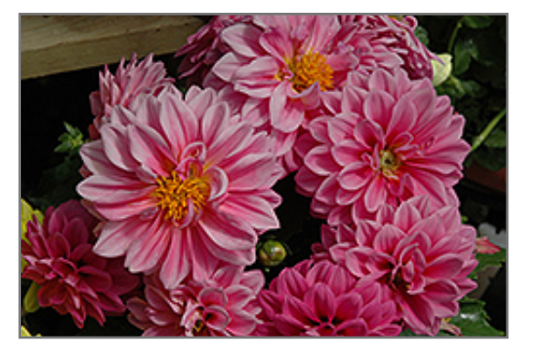
Dahlinova Hypnotica Pink Dahlia flowers