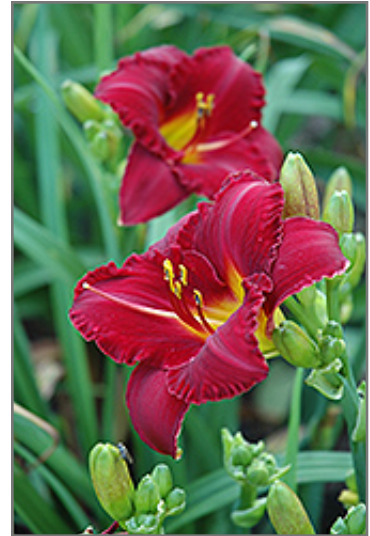
Pygmy Prince Daylily flowers