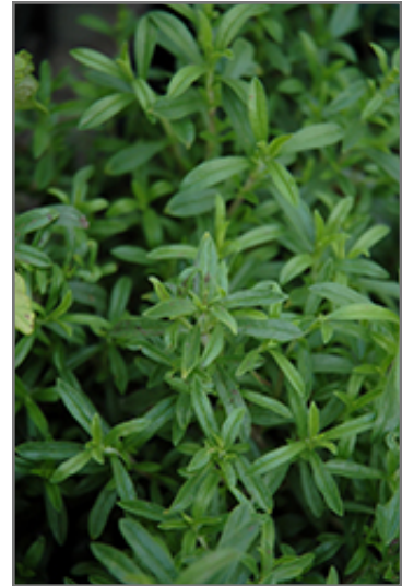
Summer Savory foliage

This plant is quite ornamental as well as edible, and is as much at home in a landscape or flower garden as it is in a designated herb garden. It should only be grown in full sunlight. It is very adaptable to both dry and moist locations, and should do just fine under typical garden conditions. It is not particular as to soil pH, but grows best in poor soils. It is highly tolerant of urban pollution and will even thrive in inner city environments. This species is not originally from North America.