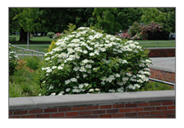
Bailey Compact Highbush Cranberry in bloom

Bailey Compact Highbush Cranberry is a dense multi-stemmed deciduous shrub with an upright spreading habit of growth. Its average texture blends into the landscape, but can be balanced by one or two finer or coarser trees or shrubs for an effective composition.