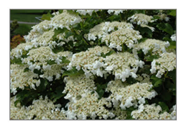
Bailey Compact Highbush Cranberry flowers