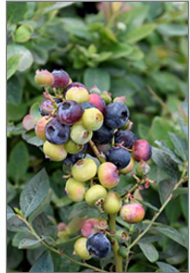
Pink Icing Blueberry fruit

Pink Icing Blueberry features dainty clusters of white bell-shaped flowers with shell pink overtones hanging below the branches in mid spring, which emerge from distinctive pink flower buds. It has bluish-green deciduous foliage which emerges pink in spring. The glossy oval leaves turn an outstanding aqua bluish-green in the fall. It features an abundance of magnificent blue berries in mid summer.