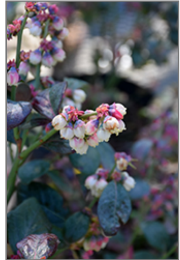
Pink Icing Blueberry flowers

This shrub is quite ornamental as well as edible, and is as much at home in a landscape or flower garden as it is in a designated edibles garden. It does best in full sun to partial shade. It does best in average to evenly moist conditions, but will not tolerate standing water. It is very fussy about its soil conditions and must have sandy, acidic soils to ensure success, and is subject to chlorosis (yellowing) of the foliage in alkaline soils. It is quite intolerant of urban pollution, therefore inner city or urban streetside plantings are best avoided, and will benefit from being planted in a relatively sheltered location. Consider applying a thick mulch around the root zone in winter to protect it in exposed locations or colder microclimates. This particular variety is an interspecific hybrid.