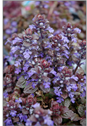
Bronze Beauty Bugleweed flowers

Bronze Beauty Bugleweed is recommended for the following landscape applications;