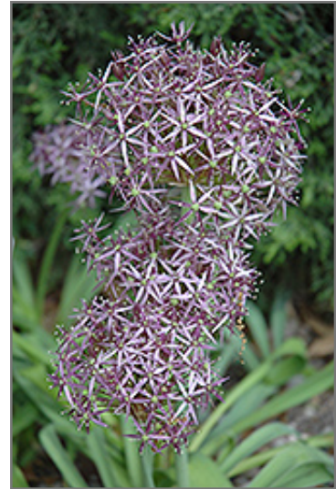
Star Of Persia Onion flowers