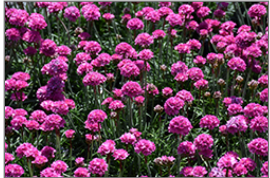
Dusseldorf Pride Sea Thrift flowers

Dusseldorf Pride Sea Thrift will grow to be only 6 inches tall at maturity extending to 8 inches tall with the flowers, with a spread of 8 inches. Its foliage tends to remain low and dense right to the ground. It grows at a slow rate, and under ideal conditions can be expected to live for approximately 10 years. As an evergreen perennial, this plant will typically keep its form and foliage year-round.