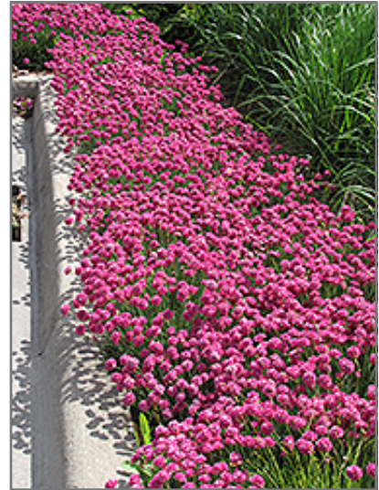
Dusseldorf Pride Sea Thrift in bloom

Dusseldorf Pride Sea Thrift is recommended for the following landscape applications;