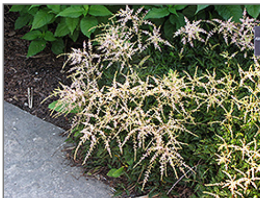
Sprite Astilbe in bloom