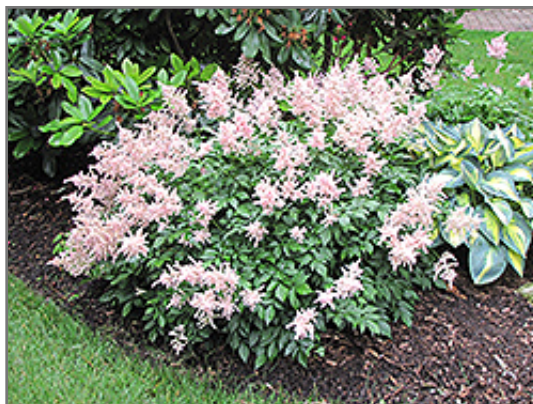
Peach Blossom Astilbe in bloom