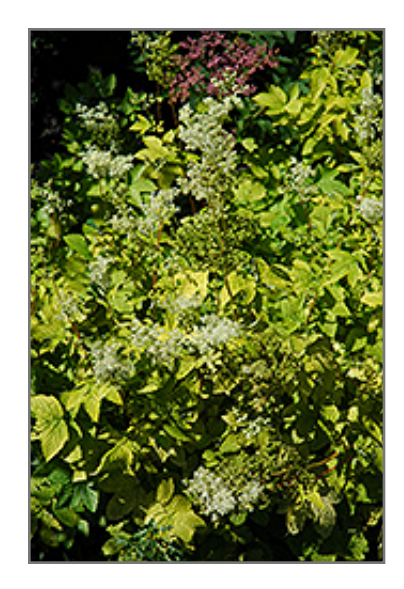
Golden Queen Of The Meadow flowers