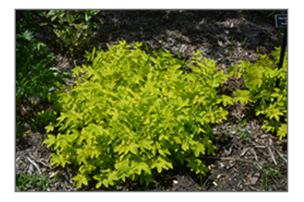
Golden Queen Of The Meadow