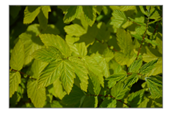
Golden Queen Of The Meadow foliage

This plant does best in partial shade to shade. It is quite adaptable, prefering to grow in average to wet conditions, and will even tolerate some standing water. It is not particular as to soil pH, but grows best in rich soils. It is somewhat tolerant of urban pollution. Consider applying a thick mulch around the root zone over the growing season to conserve soil moisture. This is a selected variety of a species not originally from North America. It can be propagated by division; however, as a cultivated variety, be aware that it may be subject to certain restrictions or prohibitions on propagation.