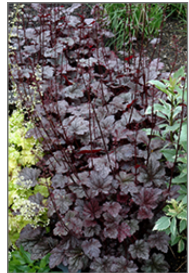
Plum Pudding Coral Bells in bloom