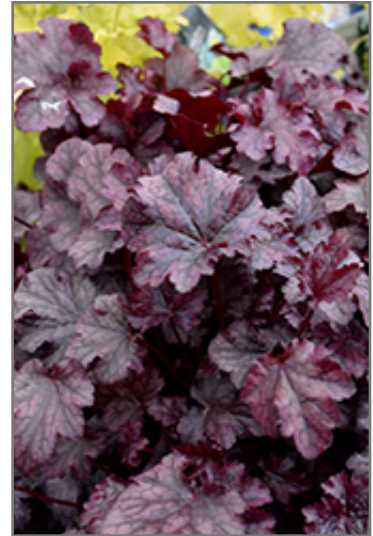
Plum Pudding Coral Bells foliage

Plum Pudding Coral Bells is recommended for the following landscape applications;