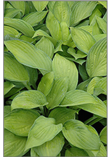
Gold Standard Hosta foliage

Gold Standard Hosta is recommended for the following landscape applications;