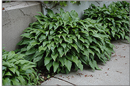
Invincible Hosta

Invincible Hosta is recommended for the following landscape applications;