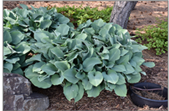
Krossa Regal Hosta