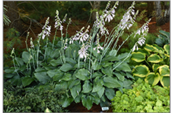
Krossa Regal Hosta in bloom

This plant does best in partial shade to shade. It prefers to grow in average to moist conditions, and shouldn't be allowed to dry out. It is not particular as to soil type or pH. It is somewhat tolerant of urban pollution. This particular variety is an interspecific hybrid. It can be propagated by division; however, as a cultivated variety, be aware that it may be subject to certain restrictions or prohibitions on propagation.