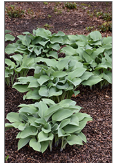
Krossa Regal Hosta