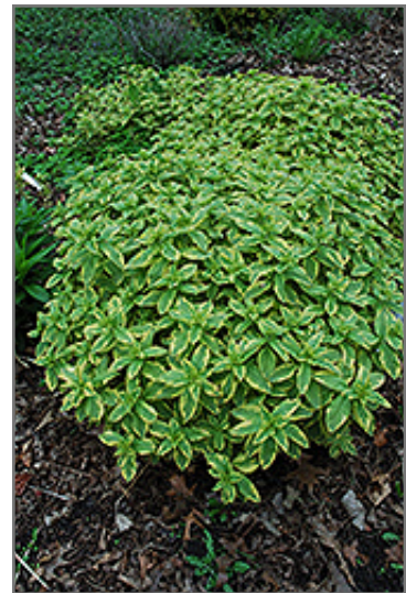
Golden Alexander Loosestrife