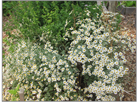
German Chamomile

This plant is quite ornamental as well as edible, and is as much at home in a landscape or flower garden as it is in a designated herb garden. It does best in full sun to partial shade. It is very adaptable to both dry and moist locations, and should do just fine under typical garden conditions. It is not particular as to soil type or pH. It is somewhat tolerant of urban pollution. This species is not originally from North America.