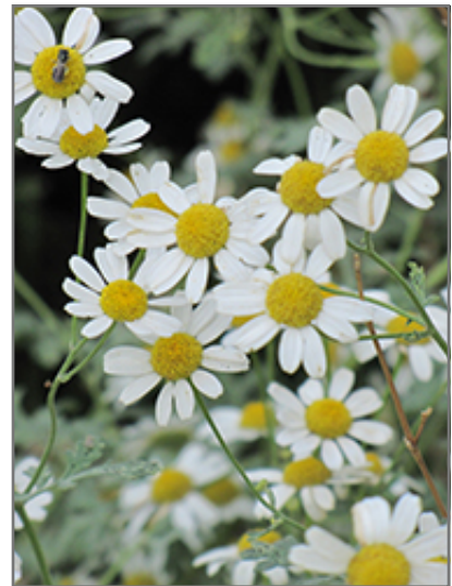
German Chamomile flowers