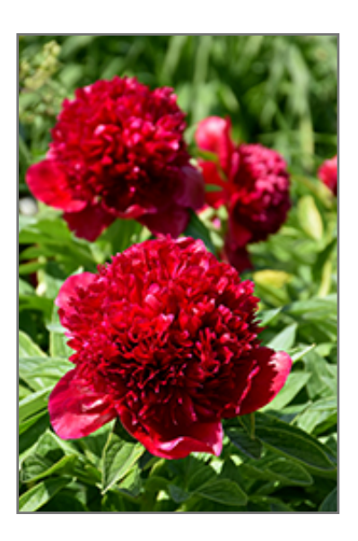
Red Charm Peony flowers

Red Charm Peony will grow to be about 30 inches tall at maturity, with a spread of 3 feet. When grown in masses or used as a bedding plant, individual plants should be spaced approximately 30 inches apart. The flower stalks can be weak and so it may require staking in exposed sites or excessively rich soils. It grows at a slow rate, and under ideal conditions can be expected to live for approximately 20 years. As an herbaceous perennial, this plant will usually die back to the crown each winter, and will regrow from the base each spring. Be careful not to disturb the crown in late winter when it may not be readily seen!