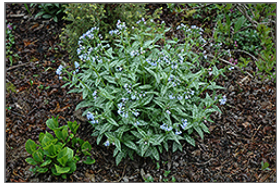
Roy Davidson Lungwort in bloom