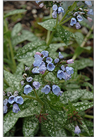
Roy Davidson Lungwort flowers