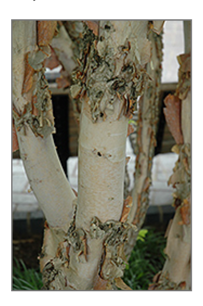
Fox Valley River Birch bark