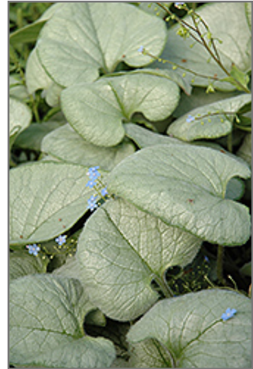
Looking Glass Bugloss foliage