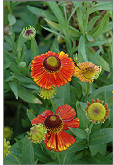
Sahin's Early Flowerer Sneezeweed flowers

This plant will require occasional maintenance and upkeep, and should be cut back in late fall in preparation for winter. It is a good choice for attracting butterflies to your yard, but is not particularly attractive to deer who tend to leave it alone in favor of tastier treats. Gardeners should be aware of the following characteristic(s) that may warrant special consideration;