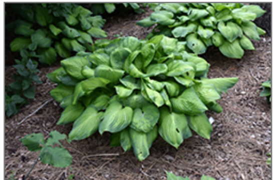
Guacamole Hosta