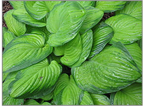
Guacamole Hosta foliage