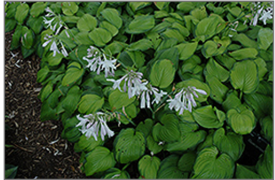
Guacamole Hosta in bloom

This plant does best in partial shade to shade. It prefers to grow in average to moist conditions, and shouldn't be allowed to dry out. It is not particular as to soil type or pH. It is somewhat tolerant of urban pollution. This particular variety is an interspecific hybrid. It can be propagated by division; however, as a cultivated variety, be aware that it may be subject to certain restrictions or prohibitions on propagation.