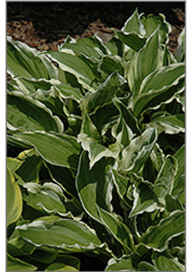
White-Variegated Hosta foliage