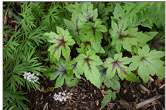
Sugar And Spice Foamflower foliage