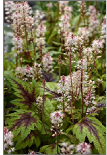
Sugar And Spice Foamflower flowers

Sugar And Spice Foamflower is recommended for the following landscape applications;