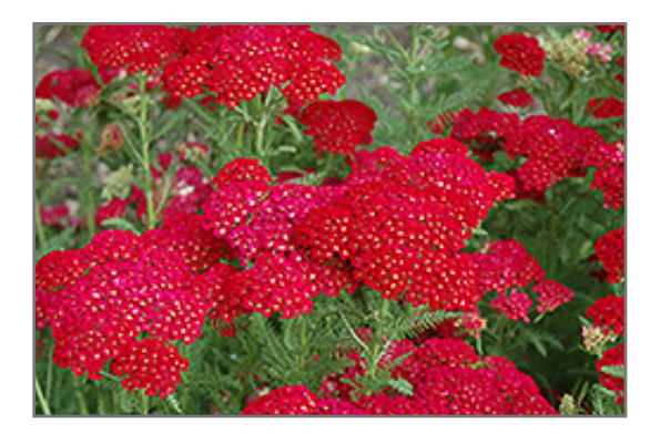
Pomegranate Yarrow flowers