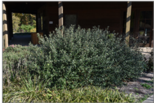
Prague Viburnum