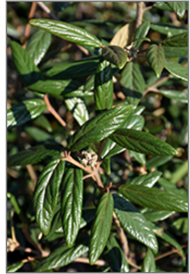
Prague Viburnum foliage

This shrub does best in full sun to partial shade. It prefers to grow in average to moist conditions, and shouldn't be allowed to dry out. It is not particular as to soil type or pH. It is highly tolerant of urban pollution and will even thrive in inner city environments. This particular variety is an interspecific hybrid.