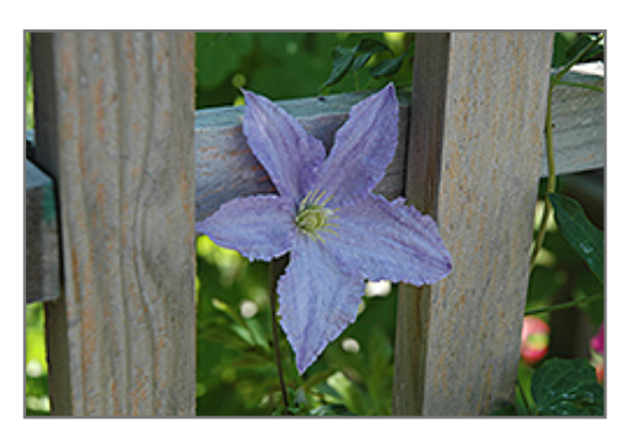
Blue Angel Clematis flowers