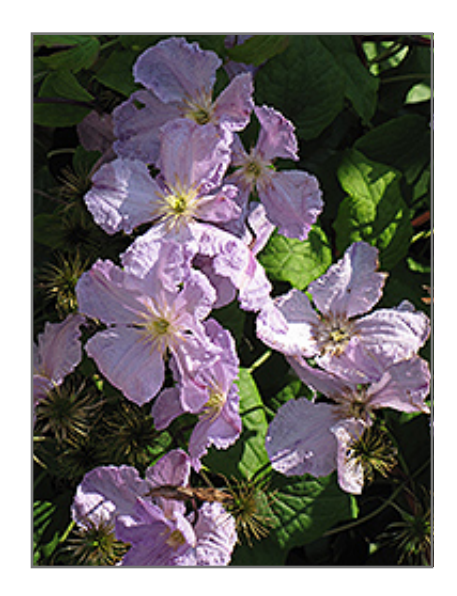
Blue Angel Clematis flowers