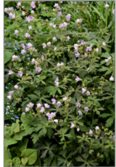
Espresso Cranesbill in bloom

Espresso Cranesbill is a fine choice for the garden, but it is also a good selection for planting in outdoor pots and containers. It is often used as a 'filler' in the 'spiller-thriller-filler' container combination, providing a mass of flowers and foliage against which the thriller plants stand out. Note that when growing plants in outdoor containers and baskets, they may require more frequent waterings than they would in the yard or garden.