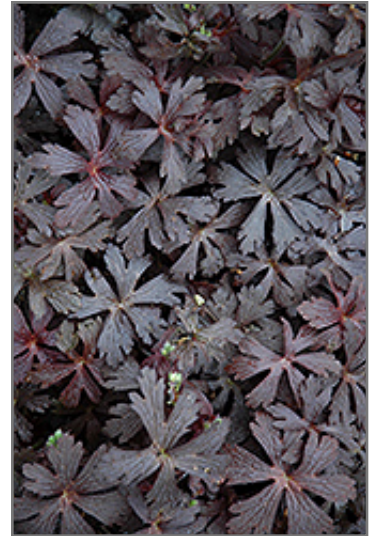
Espresso Cranesbill foliage