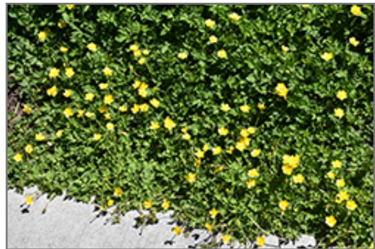
Barren Strawberry in bloom